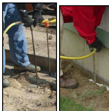
Far left: The applicator completes the interior vertical application before the flat concrete surface is poured.

Vertical chemical barriers must be established in the soil around the base of foundations, plumbing fixtures, foundation walls, support piers and voids in masonry, and any other critical area where structural components extend below grade.